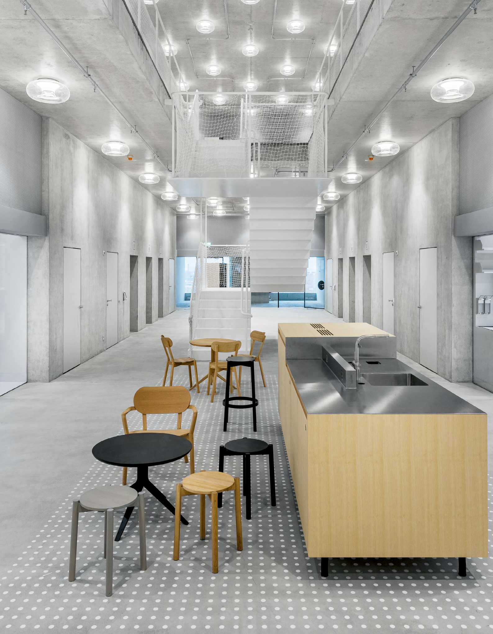
Biozentrum, Basel, Switzerland Luminaires applied: Torus Bespoke. Design: Ilg-Santer Architekten AG und Licht Kunst Licht AG.