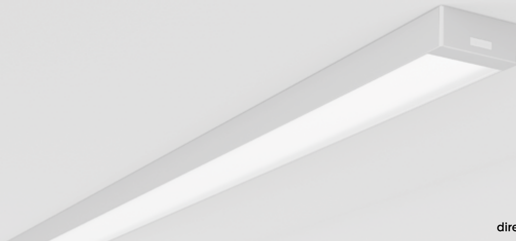
direct light emission