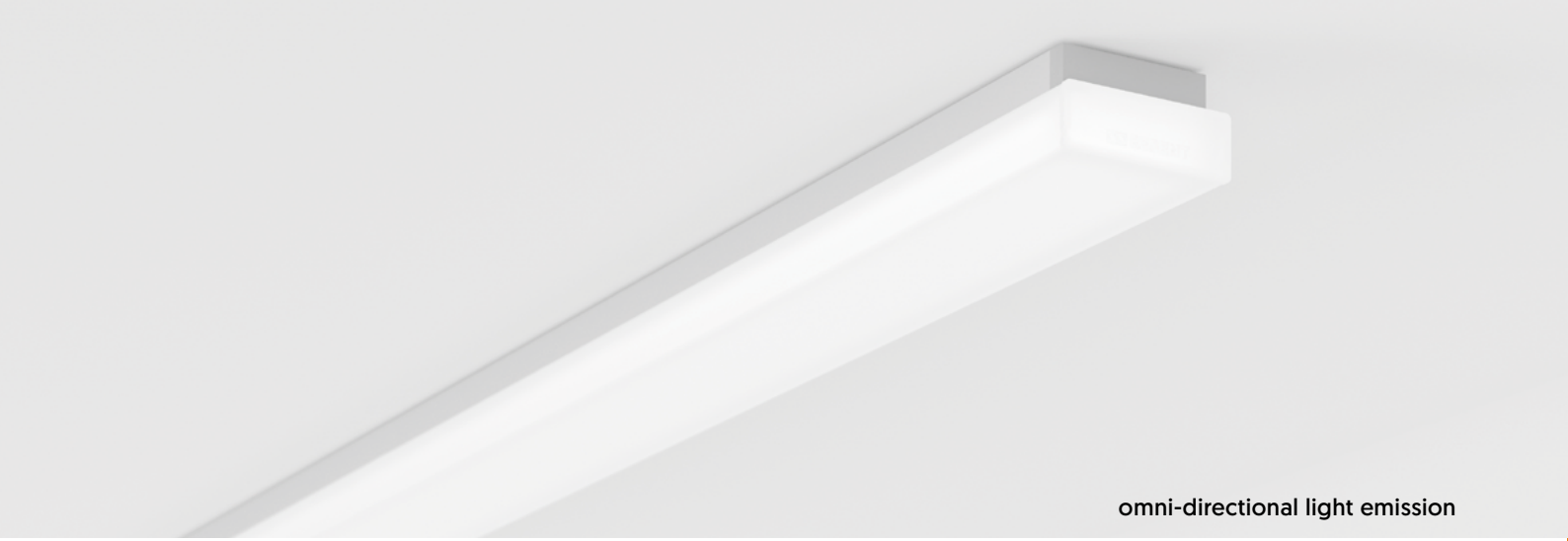
omni-directional light emission